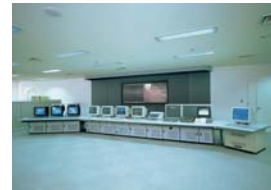
Total monitoring system for water supply and sewage system