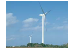
Wind turbine generator system