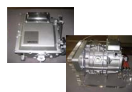
Drive system for EV