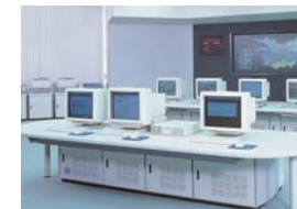
Supervisory control system for sewage treatment system