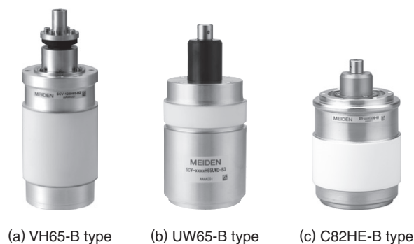
Fig. 2 Ball Screw Type

For the Auto-VC, we measure the capacitance at the time when we ship our product from factory. By calibrating the capacitance setting command, we realized the capacitance setting accuracy level of ±0.5% or less (These of typical VVCs are ±5%.) In addition, when customers adopt VVCs, they will face issues such as shape of connection between