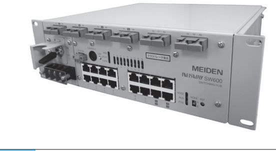
Fig. 3 SW600

In order to handle such various data, it is essential to add a bandwidth control function to "secure the important data by ensuring the booked bandwidth at the synchronized clock time." Conventional bandwidth control technique depended on performance of dedicated network device with switching engine but from now on, as our future option, we are also working on to adopt PTP as mentioned above as per IEEE 802.1 Time-Sensitive